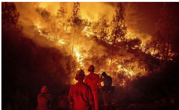
Figure 1: Climate hazards are increasing globally in ways that will have an impact on risk mitigation options. In 2018 simultaneous wildfires in Australia and California limited fire-fighting capabilities shared between the United States and Australia. Fires in (top) Bega Valley, NSW and (bottom) California both occurred in August 2018.