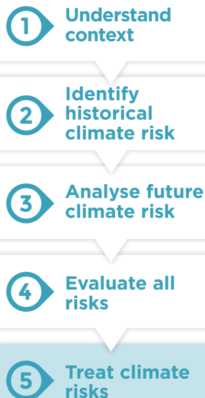
Figure 2: The ESCI Climate Risk Assessment Framework